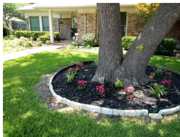
RIGHT PHOTO: HARKNESS