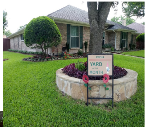
TOP PHOTO: CREPE MYRTLES (CLAYMORE)