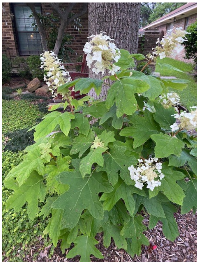
LEFT: OAK LEAF HYDRANGEA (BURNHAM)

***please note: These are expenses for only one month (May 2022).