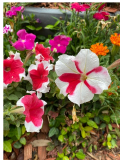
RIGHT: MAY LILIES (FALL MANOR)