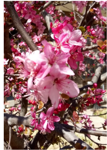
ABOVE: SIGNS OF SPRING (HALWIN)

Please look for more opportunities for neighborhood/alley cleanup in the future. They will be announced as scheduled.