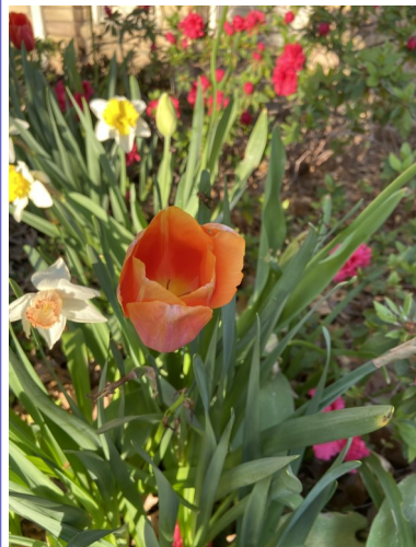
LEFT: FLOWER MEDLEY (HALWIN)