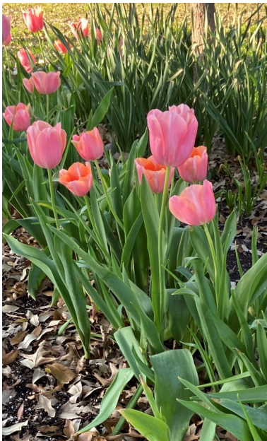
ABOVE: SPRING TULIPS (HALWIN)